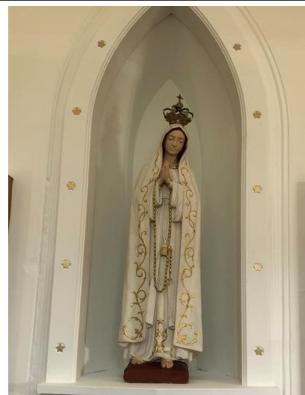
OUR LADY OF FATIMA FRONT PORCH