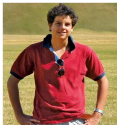
Blessed Carlo Acutis

Please see the notice boards in the Church porches for details of the Churches and dates where the relic will be visiting.