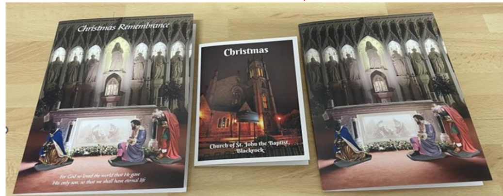
Triduum €4 €3 for 5 cards €5 for 5 cards

Parish Christmas Cards The Parish Christmas Cards will be available next week from the Parish Office and after Masses on Sunday. The intentions of those to whom the cards are sent will be remembered in a Triduum of Masses to be celebrated in preparation for the feast of Christmas. The second and third card is a regular card with no Mass intentions with a beautiful picture of the Bell Tower and Christmas Altar scene. The prices are listed below.