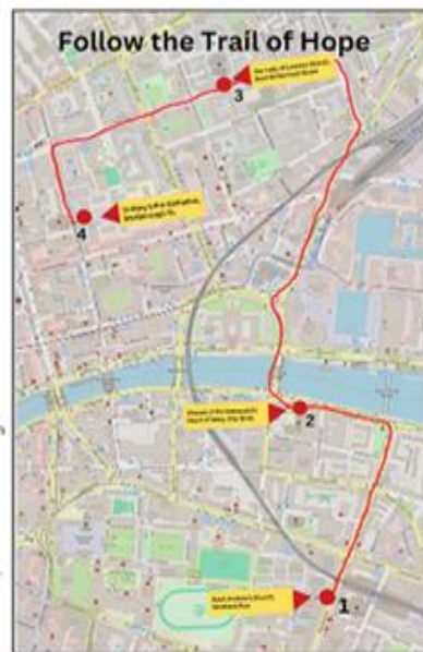
PH Cover 2 "Pockets of Hope" - 2025 was the 100th anniversary of the death of St. Peter, whose shrine is in Sean McDermott St. Church. **City Quay Street is closed for refurbishment. When events start alternative arrangements will be made.

WHAT: An invitation to journey on a mini Pilgrimage to contemplate the theme of Hope based on the words of Pope Francis's document written for this Jubilee Year 2025 entitled "Hope Does Not Disappoint". WHO: For everyone seeking Hope. WHERE: You're invited to come to the City and journey through Dublin City's four inner-city churches of St. Mary's Pro Cathedral, Marlborough Street, Our Lady of Lourdes, Sean McDermott Street, Immaculate Heart of Mary, City Quay** and St. Andrew's Church, Westland Row. WHEN: Throughout the Jubilee Year of Hope 2025 beginning on the 29th Dec 2024. WHY: Why not? HOW: Download our map and directions by scanning our QR Code or just go to St. Andrew's Church, Westland Row and start there.